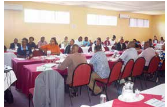
Part of the audience that attended the workshop.