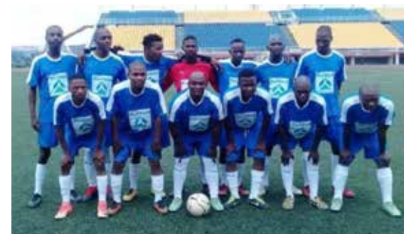
Lesotho PostBank men soccer team