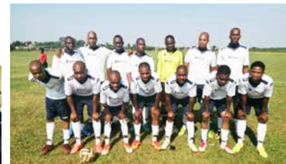
Eswatini Bank men soccer team