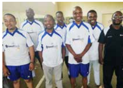
Eswatini Bank volleyball team