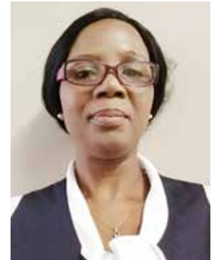
By Eunice Malaza Senior Human Resources Officer

Think of anxiety as a call to action to make a change, start a project, prepare for a challenge and not as a roadblock to your goals. It's like nitrogen for a garden too much will burn the plants, but too little causes pale leaves and stunted growth. Let anxiety have its rightful place in your life to live more fully and freely.