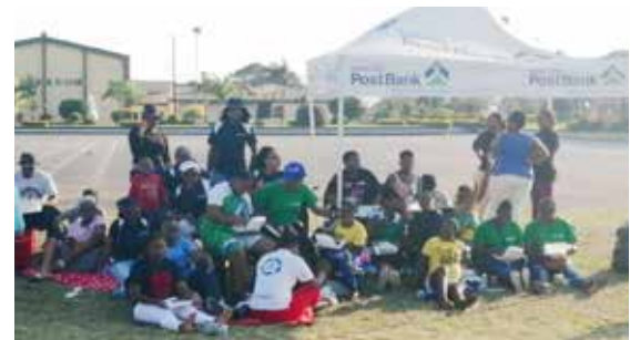
Part of Lesotho PostBank group

Correctional Services won 5-0 in a volleyball match against Eswatini Bank.