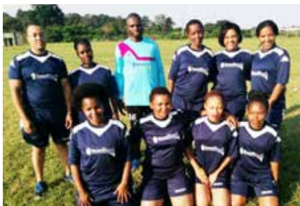
Eswatini Bank Ladies soccer team