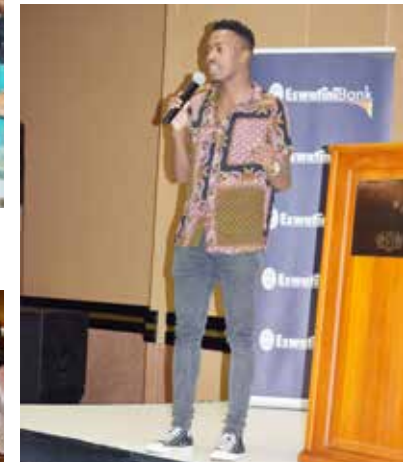
Comedia Mdura entertaining the audience.